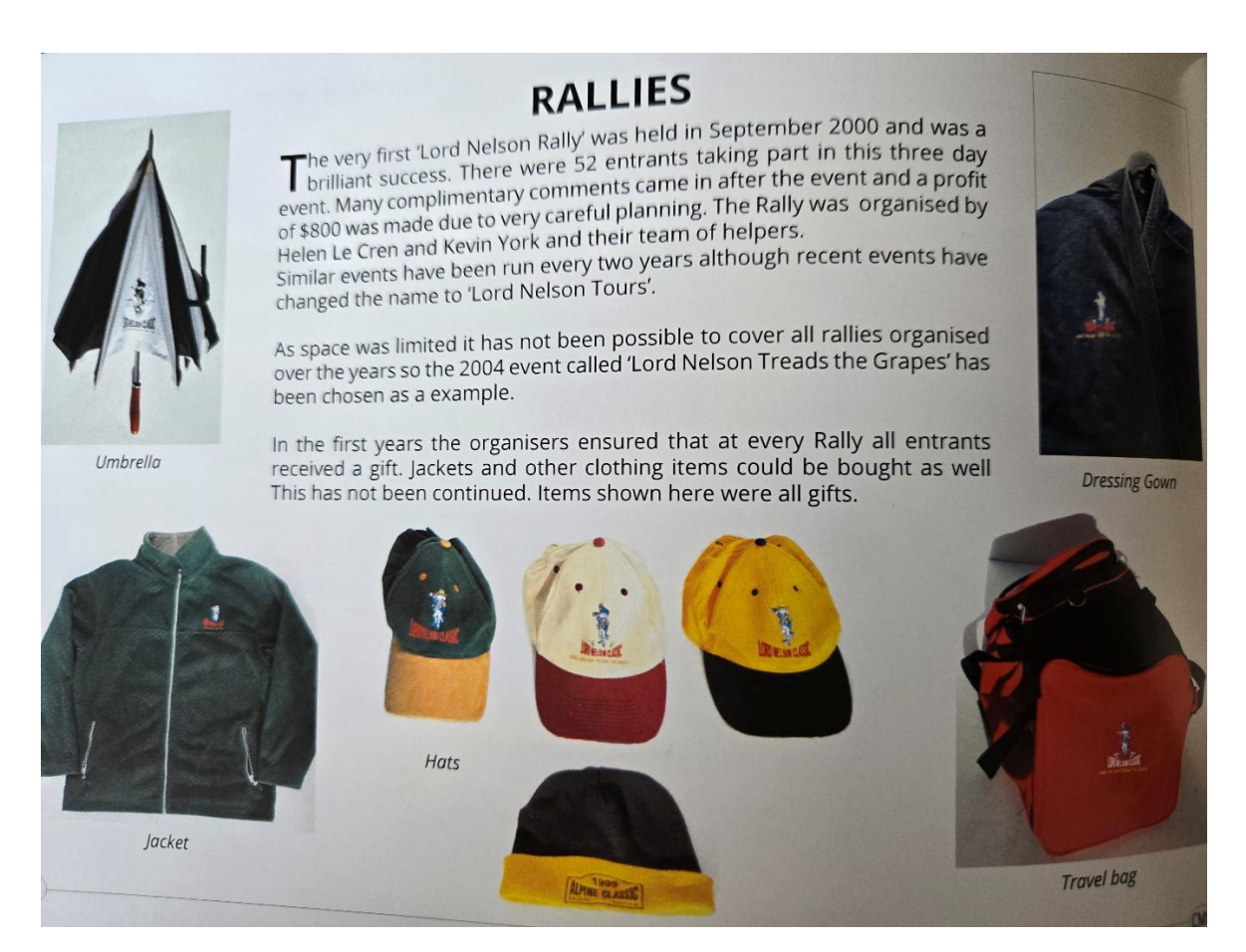
How many have some of these hanging about?????