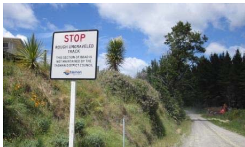
Very dusty roads