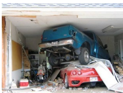
Ooops foot slipped, sorry.

Ooooh here is a bonnet open, I wonder what hides beneath?