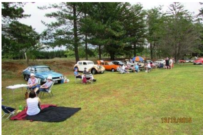
Relaxing before the rain came!!

13 th December: Rabbit Island Barbeque started with sunny blue skies, a perfect day for barbequing, then proceeded to cloud over, then the light rain came, then the heavy rain cleared the area. Fortunately by this time most if not all, had cooked (burnt?) and eaten the delights of the BBQ. Numbers were down on previous years but still I counted 35 cars so not too bad considering the conditions.