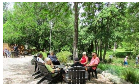
Washing the dust out of the throat

13 th December: Rabbit Island Barbeque started with sunny blue skies, a perfect day for barbequing, then proceeded to cloud over, then the light rain came, then the heavy rain cleared the area. Fortunately by this time most if not all, had cooked (burnt?) and eaten the delights of the BBQ. Numbers were down on previous years but still I counted 35 cars so not too bad considering the conditions.