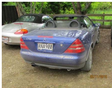
Very dusty cars