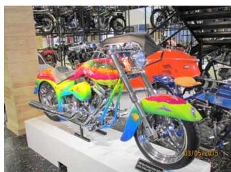
Brightly coloured Harley

3 rd May Visit to New Zealand Motorcycles A small number of members attended the lunch, then 15 members arrived to view the incredible collection of motorcycles. A trip down memory lane for the reminiscing motorcyclists amongst us. There are no Japanese bikes on display, only British, American and European from the early 1900s to the early 21 st century. What an interesting afternoon!