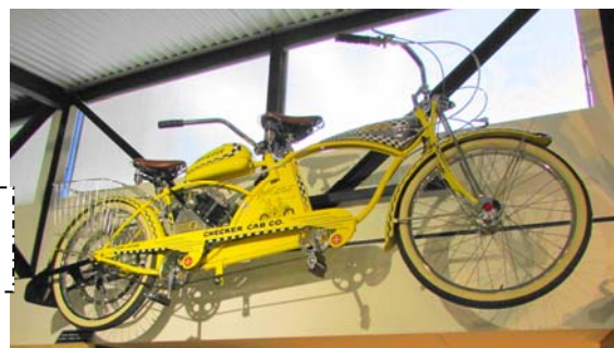
Motor Bicycle built for two