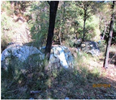
Where old Vauxhalls go to rust in peace