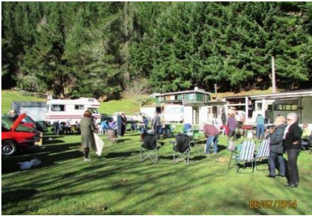
Gowan Valley, amongst the cabins

about their experiences growing up, living and working in the Gowan. They bred them tough in those early days. We were invited to look around the many buildings and their "hidden treasures". Thanks go to Ladd for organising this very interesting day and pleasing to have such a good number attend.