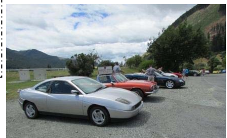
First in gets the shady park.