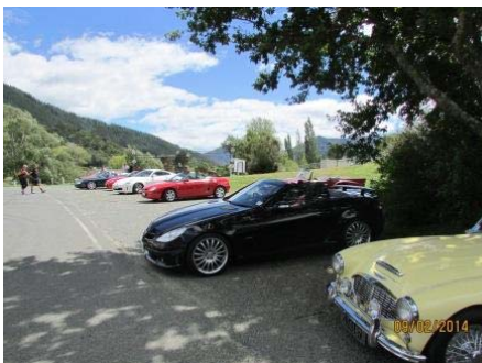
At the A.G.M.