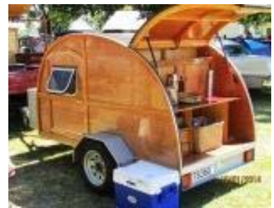
A small selection of the many different types of vehicles on display