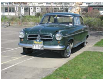
A European Classic—Borgward Isabella

The original “Swedish Taxi” - Volvo P1800