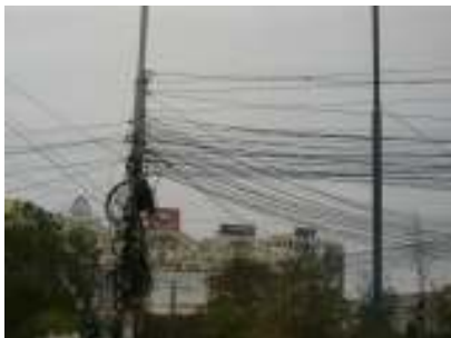
Street wiring in Romania - anyone heard of OSH?