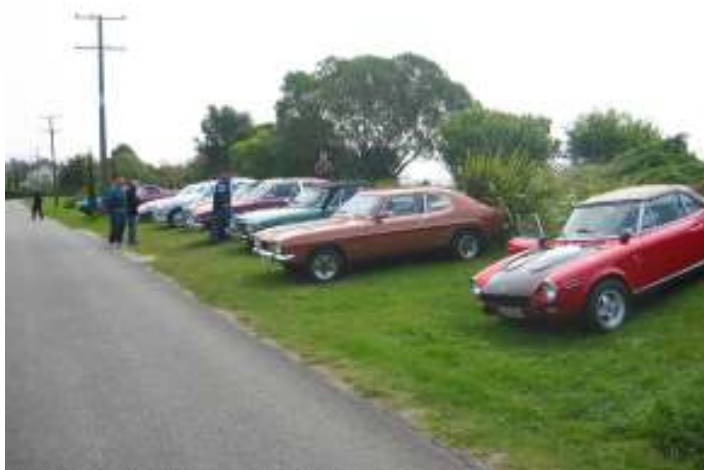
Cars parked at Patons Rock, Golden Bay for a BBQ, October 14th. See report page 4.