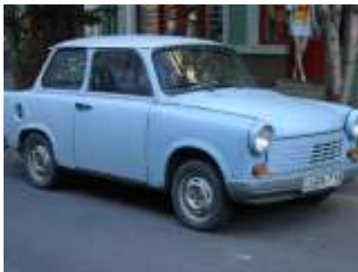
An extremely tidy Trabant.

Countries visited included Singapore (as a stop-over each way) Czech Republic, Germany, Austria, Hungary, Serbia, Bulgaria and Romania, also