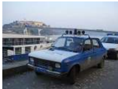
Typical Police car in Serbia. Luckily they don't have boy racers!