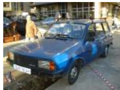
Parking is at a premium - so why not knock over some roadwork signs and park here!