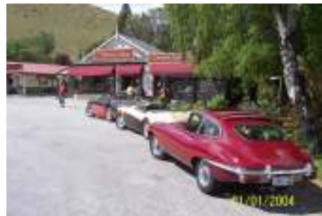
Morning tea at the Tarris store