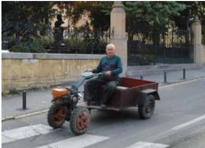
Interesting transport in Serbia.

We visited Prague for 3 days at the beginning of the tour and this is a wonderful city with such great history. An interesting feature here was a Beer Walk we took as a group one evening and this turned out to be a highlight with an excellent guide talking about places in the Old City. Czech Republic