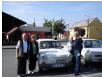
Four peasants about to steal a luxury car - they couldn't start it!

A local kind enough to let Frank snap her shop .