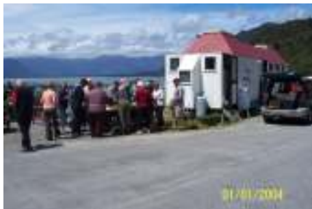
Lunch at the Pie Cart, Jacksons Bay