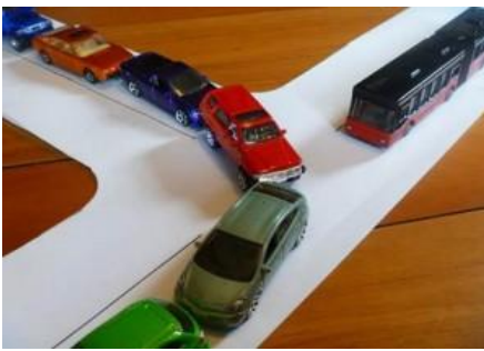
No one gives way to buses