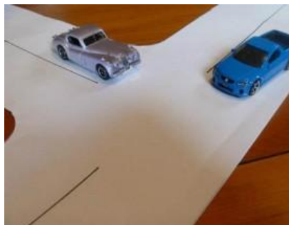
Classics always have right of way