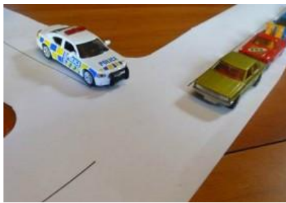
Police have right of way over everyone else