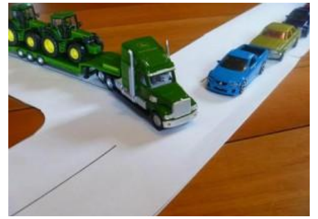
Big Trucks always have right of way