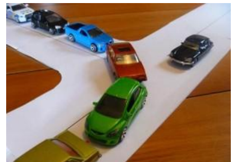
Citroen D S has right of way but it's French so no one gives way