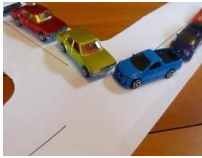
Holden's never give way to Fords