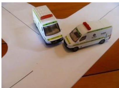
Ambulances have to fight it out