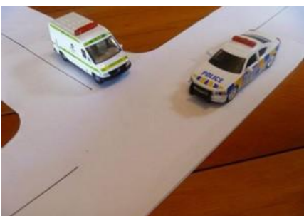
Police give way to ambulances