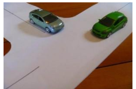
Japanese or Korean cars, who cares!

Please remember these simple rules and make the roads much safer for classic cars