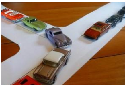
Real classics have right of way over not really classics eg Morris Marina