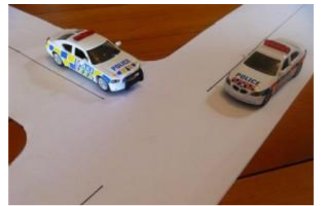
Real Police have right of way over Traffic Patrol Police