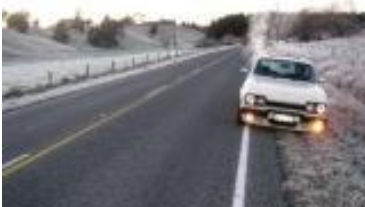
Frosty morning in the Motueka Valley