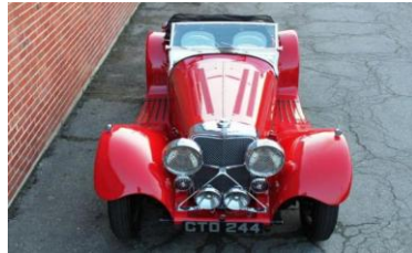
1936 Jaguar SS 2 1/2 L Sports £265,000 English Pounds