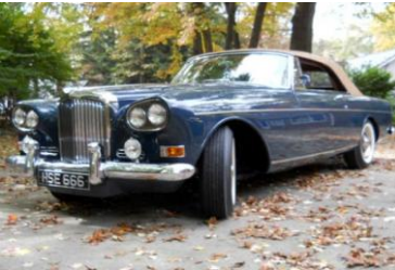
1963 Bentley S3 Continental £149,950 English Pounds