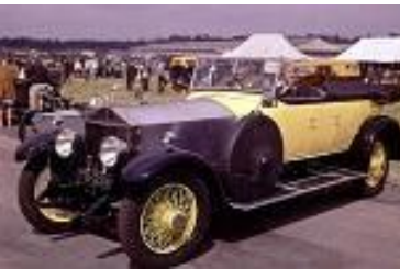
1927 Rolls Royce Phantom Price not listed