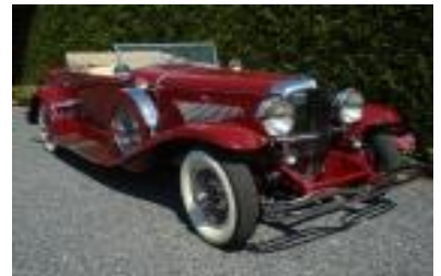
1929 Duesenberg Murphy J Convertible $595,000 US

Have something for the newsletter, or any suggestions?