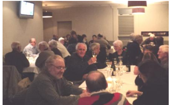
Celebrating the mid winter Christmas Dinner.