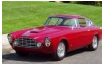
1953 Aston Martin DB2 / 4 Allemano Coupe. No price