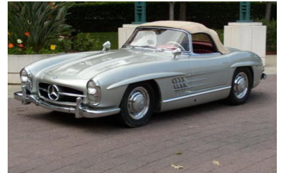
1961 Mercedes 300 SL Roadster £395,000 English Pounds